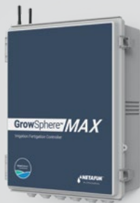
GrowSphere™ MAX without screen