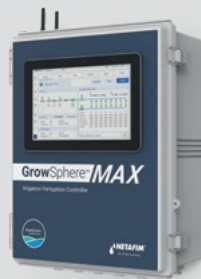
GrowSphere™ MAX with screen