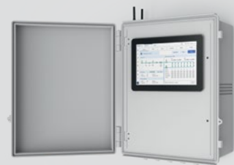
GrowSphere™ MAX double door with screen